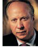
David R. Gergen, Director, Center for Public Leadership Harvard Kennedy School, USA