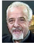
Paulo Coelho, Author, Brazil

"The Schwab Foundation put the term Social Entrepreneurship on the agenda. In the recent past, the global economic structure has been challenged by greed on the one hand and loss of trust on the other. In this context, the work of Social Entrepreneurs who are nurturing their ideas through groundbreaking innovations and courageous leadership has helped to drive and instil change in the world ... I believe that the momentum created will help re-establish those aspects of the economic world that we seem to have lost in the last decade."