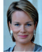
H.R.H. Princess Mathilde of Belgium Honorary Board Member