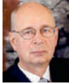
Klaus Schwab, Founder and Executive Chairman, World Economic Forum