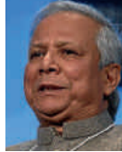
Muhammad Yunus, Managing Director, Grameen Bank, Bangladesh

"The Schwab Foundation provides its community of Social Entrepreneurs with a unique space and opportunity to engage directly with and influence global leaders, who drive development trends, to act in favour of the poor."